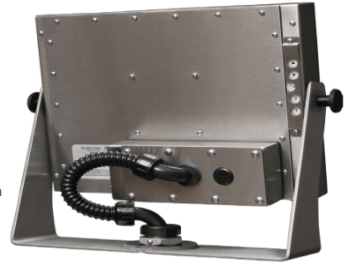
Rear-mount KVM Extender; shown with 17" Universal Mount Industrial Monitor